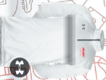
*2 UNQUINTED 1/4 ZIP WHITE • 1-20 $44