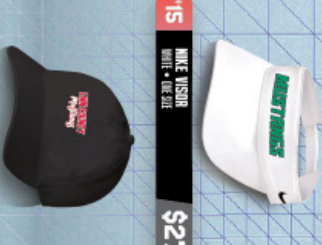
*15 NIKE VISOR WHITE • ONE SIZE $27