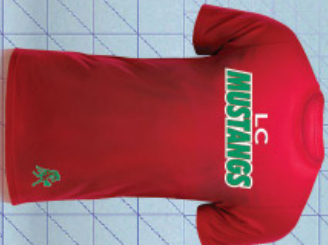
*13 SHORT SLEEVE TEE RED • 1-20 • AVAILABLE $15