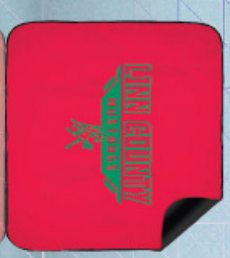
*17 STADIUM BLANKET RED • 47"X57" $26