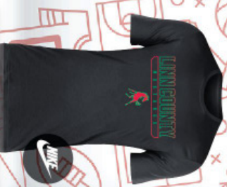
*9 NIKE CORE TEE BLACK • 1-20 • AVAILABLE $20