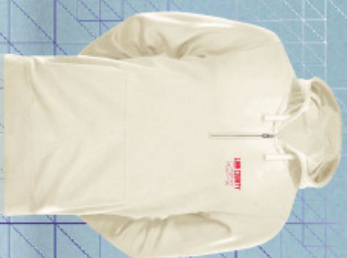
*11 SPORT-STYLE 1/4 ZIP PERFECT HOODIE WHITE • 1-20 $30