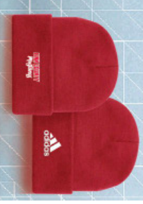
*18 ROOMS COFFEE KNT BEANIE RED • ONE SIZE $21