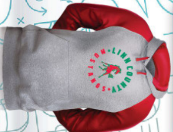
*4 COOL BLACK HOODIE GREY • 1-20 • AVAILABLE $31