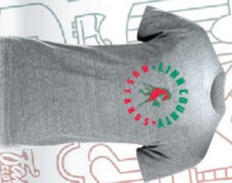
*8 ELEGANT WINTRE TEE GREY • 1-20 • AVAILABLE $18