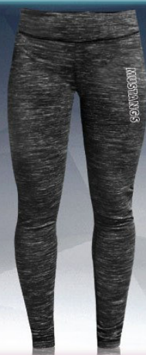
#23 YOGA PANTS HEATHERED CHARCOAL • S - 2XL $30