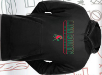
*5 HOODIE BLACK • 1-20 • AVAILABLE $28