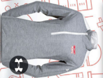
*6 UN LINDS* HOT SHOT 1/2 ZIP GREY • 1-20 $45