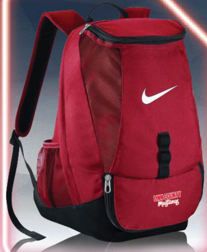
#27 NIKE SWOOSH BACKPACK RED • 11" x 8" x 22" $45