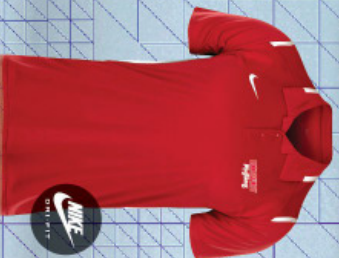
*14 NIKE COMEBODY POLO RED • 1-20 $42