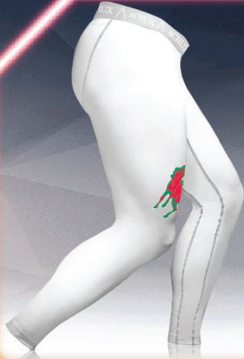
#22 MEN'S PERFORMANCE TIGHTS WHITE • S - 2XL $29