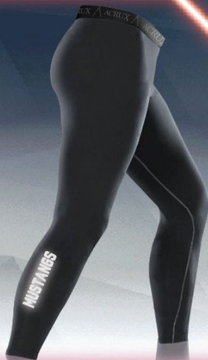
#24 LADIES' PERFORMANCE LEGGINGS BLACK • S - 2XL • WITH REFLECTIVE DESIGN $29