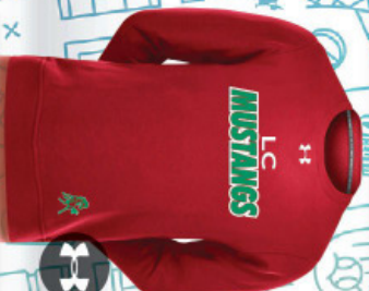
*7 UN RINGED FLEECE CREWNECK RED • 1-20 • AVAILABLE $39