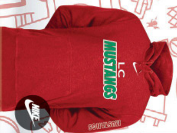
*3 NIKE TEAM CLUB HOODIE RED • 1-20 • AVAILABLE $37