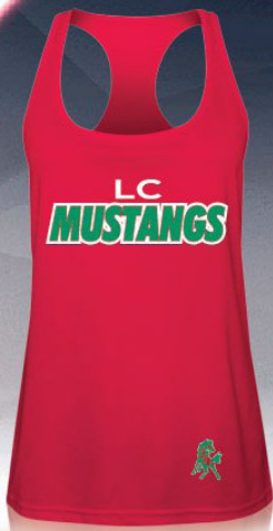
#19 LADIES' PERFORMANCE RACERBACK RED • S - 2XL $22