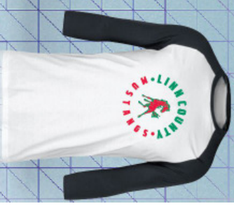
*12 RING ON BLACK/WHITE • 1-20 • AVAILABLE $21