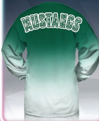
#26 DIP DYE COLLEGE TEE GREEN • S - 2XL $27