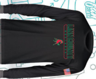
*1 LONG SLEEVE TEE BLACK • 1-20 • AVAILABLE $21