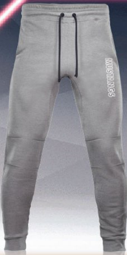
#25 FLEECE JOGGERS GREY • S - 2XL • WITH POCKETS $28