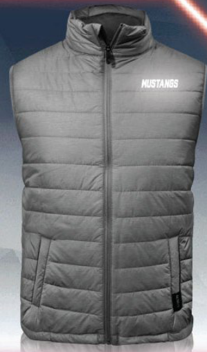
#21 PREMIUM PUFF VEST CHARCOAL • S - 2XL • *WITH REFLECTIVE DESIGN $29