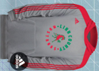
*10 ROOMS STITCHED SLEEVE HOODIE GREY • 1-20 $42