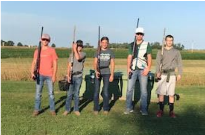
Eight FFA students participated in fall trapshooting contests. Students learned safety, gun handling skills, and how to have fun busting targets.