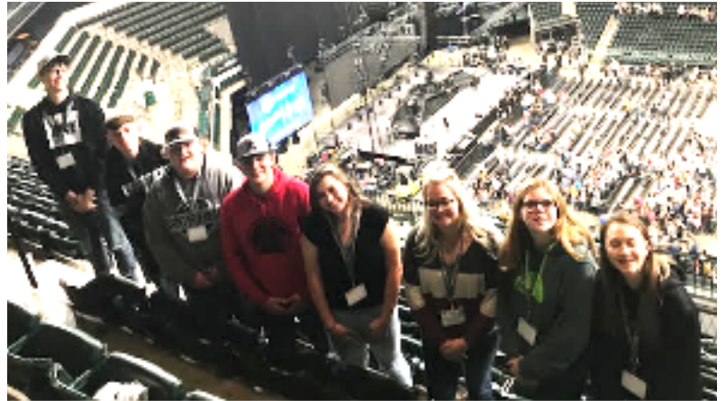
Old Dominion concert at National Convention

National FFA Convention was Oct 29-Nov 2 in Indianapolis, Indiana. Eight Linn County R-I FFA members attended sessions, farm tours, concerts, shows, and recreational activities while in Indiana.